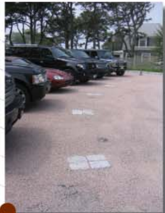
Parking Material Precedents

Note: Please refer to Site Plan Sheet XXXX for more details on the proposed public Artisan's Park Overlook.